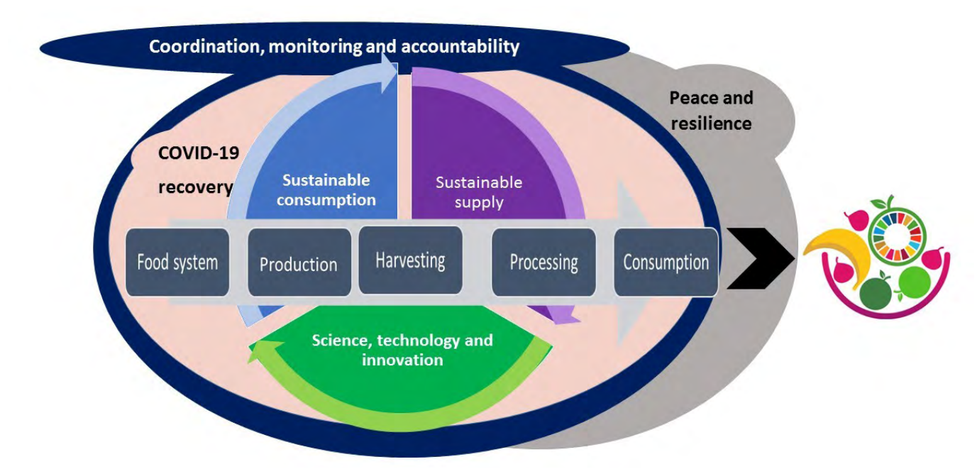
Figure 3: Food system transformations and solutions related to Action Track 1.

With increasing warming, the frequency, intensity and duration of heatwaves, droughts and extreme rainfall events are projected to increase in most world regions, increasingly threatening the stability of